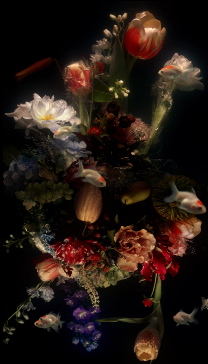
DISENCHANTMENT OF THE WORLD Moving image | 52 seconds Edition of 3 $9600