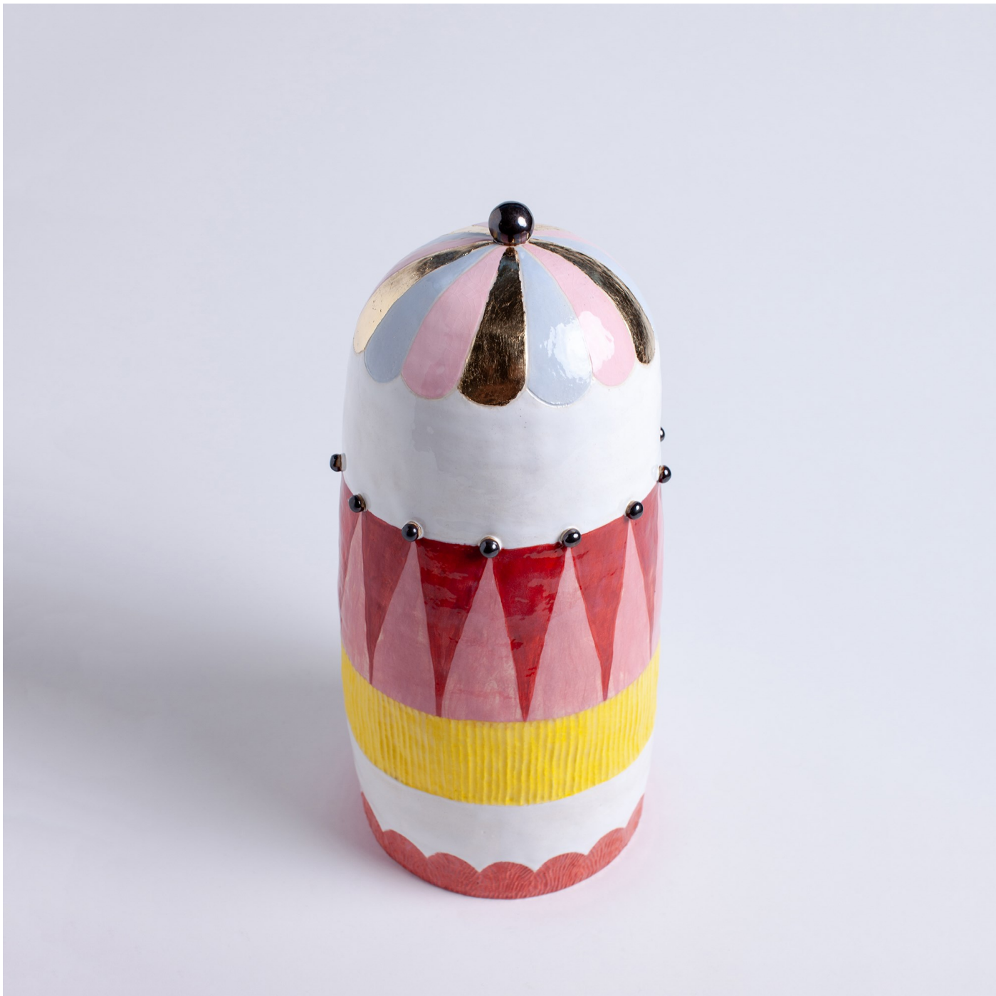
Loops (Tent) , 2023 Glazed earthenware + composite gold 39cm H x 17cm W x 17cm D $2500