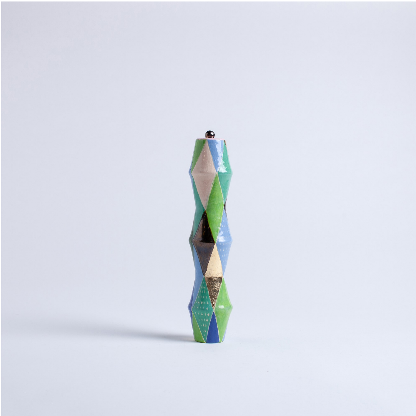
One Step at a Time, 2023 Glazed earthenware + composite gold 29.5cm H x 6.5cm W x 6.5cm D $650