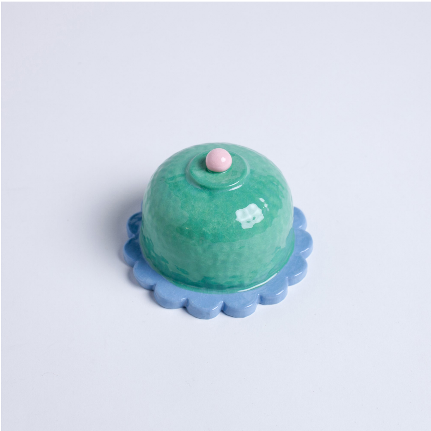
Count to Three #2, 2023 Glazed earthenware 10.5cm H x 7cm W x 10.5cm D $450