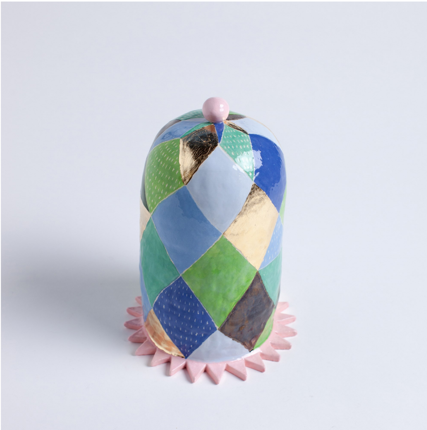
Harlequin Dreamer , 2023 Glazed earthenware + composite gold 26cm H x 18.5cm W x 18.5cm D $1500