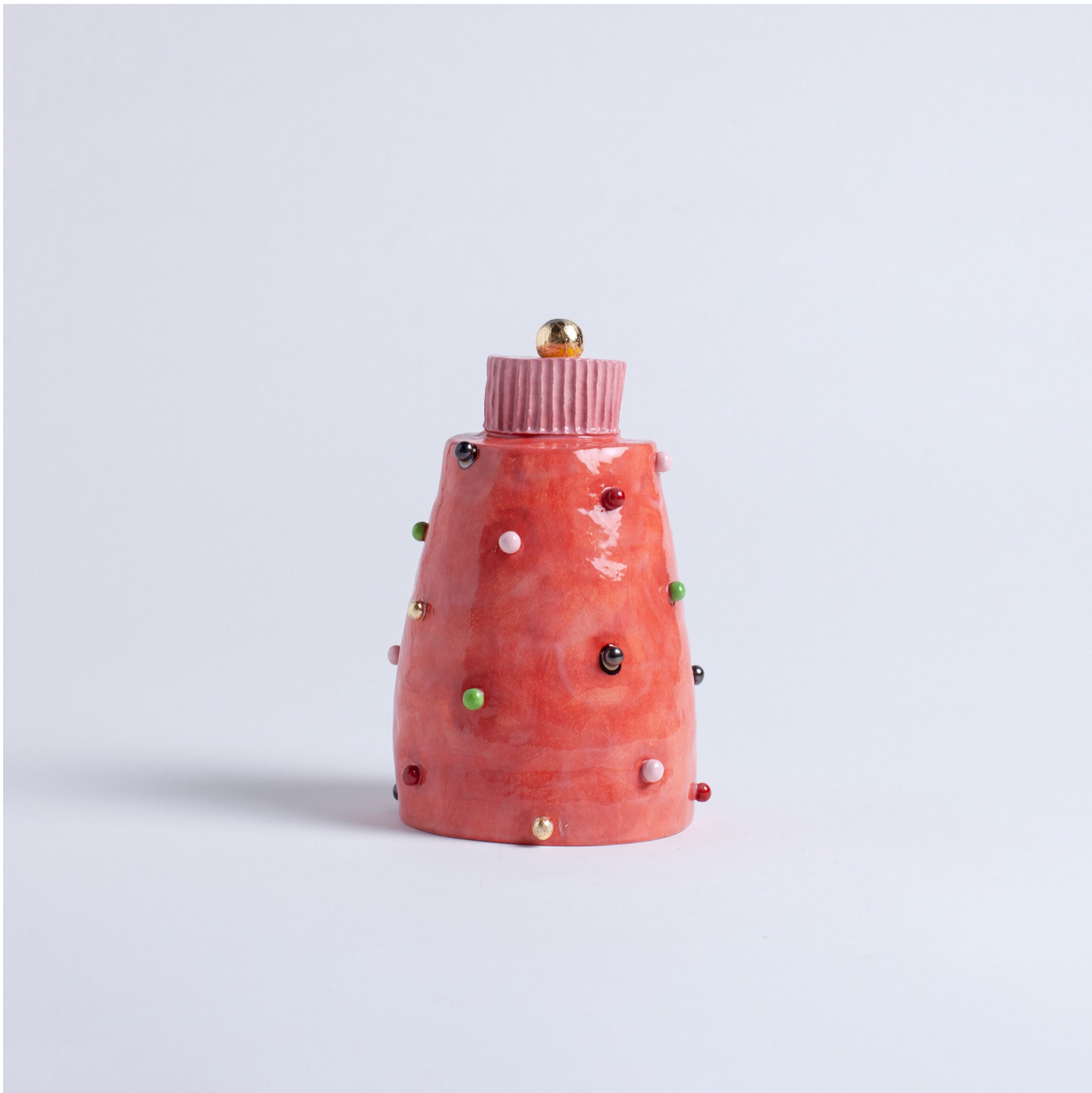
Sore Spots , 2023 Glazed earthenware + composite gold 23cm H x 15cm W x 13.5cm D $1200