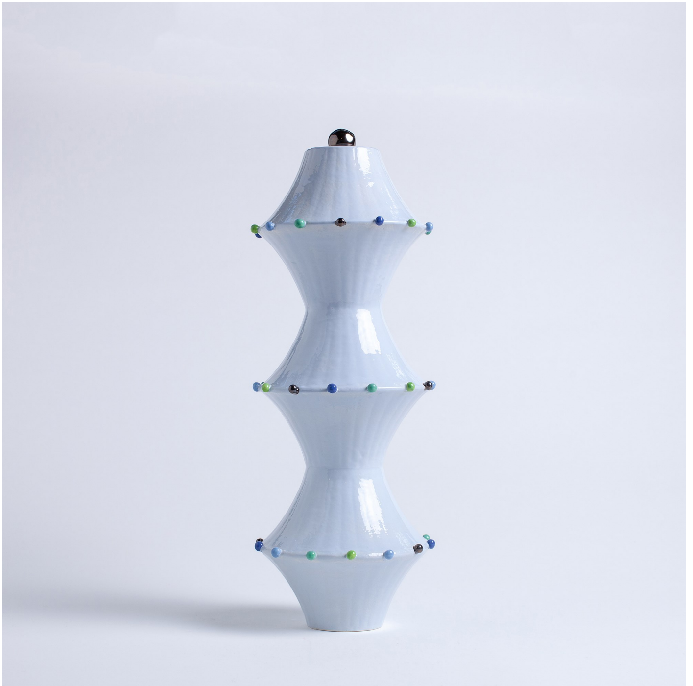
Stacks On , 2023 Glazed earthenware 47.5cm H x 18cm W x 18cm D $2900