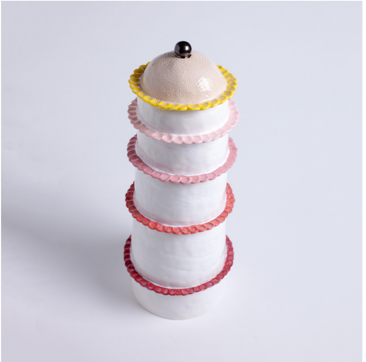
Flowers Never Bend in the Rain , 2023 Glazed earthenware 48cm H x 19cm W x 19cm D $2900