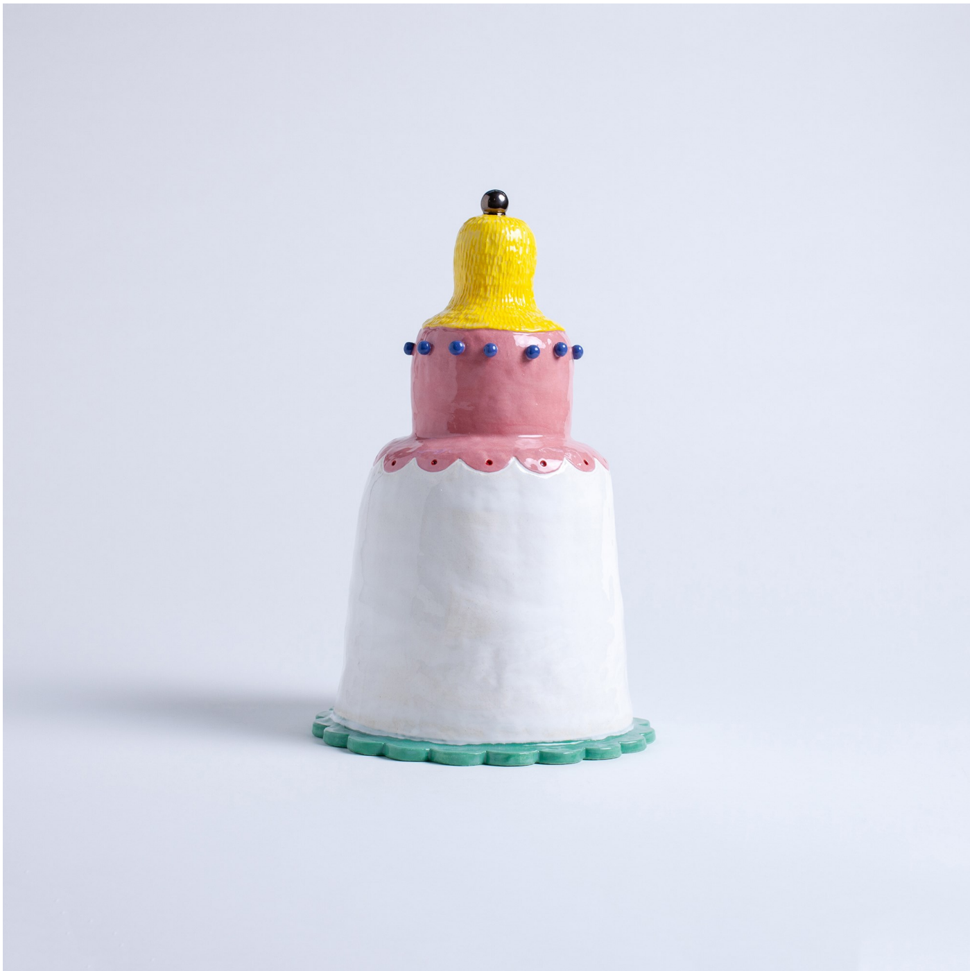
Push the Sky Away , 2023 Glazed earthenware 33.5cm H x 22cm W x 22cm D $2200