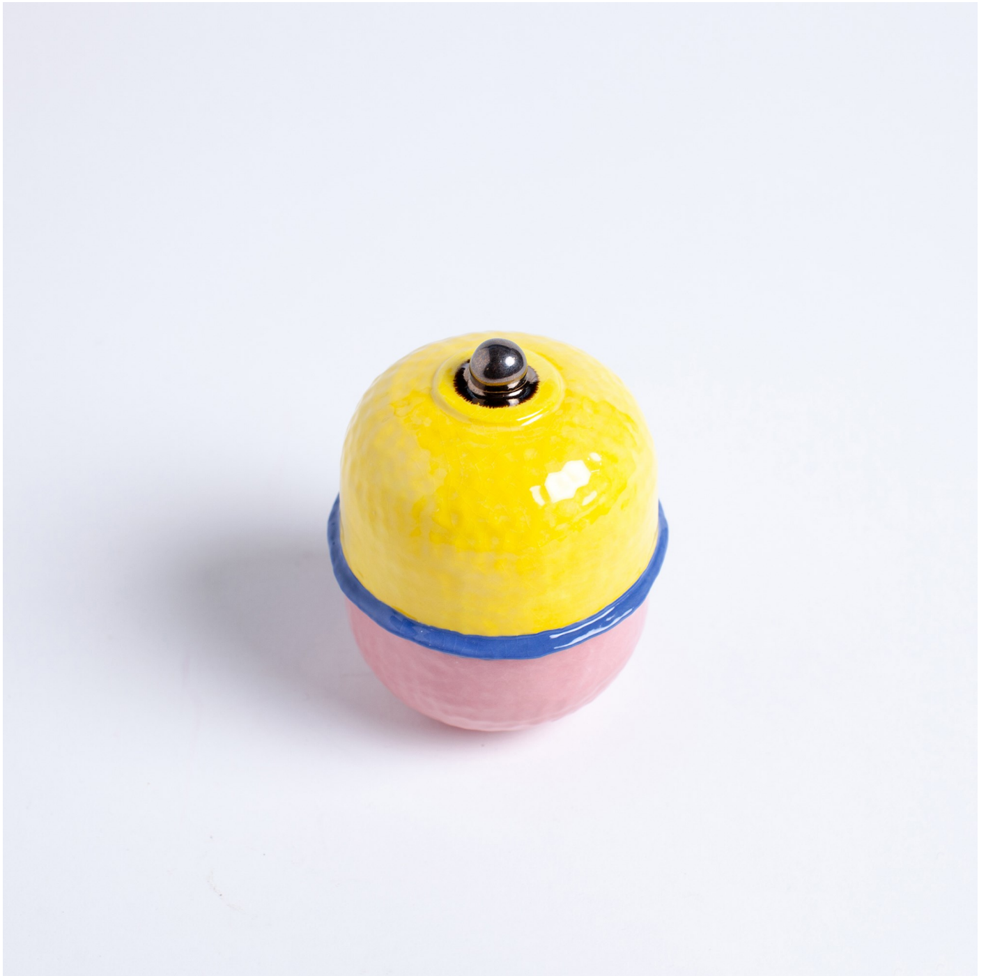
Peals of Laughter , 2023 Glazed earthenware 10.5cm H x 9cm W x 9cm D $550