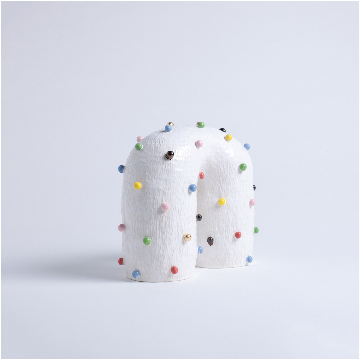
Ground Yourself, 2023 Glazed earthenware + composite gold 25cm H x 30cm W x 14cm D $2100