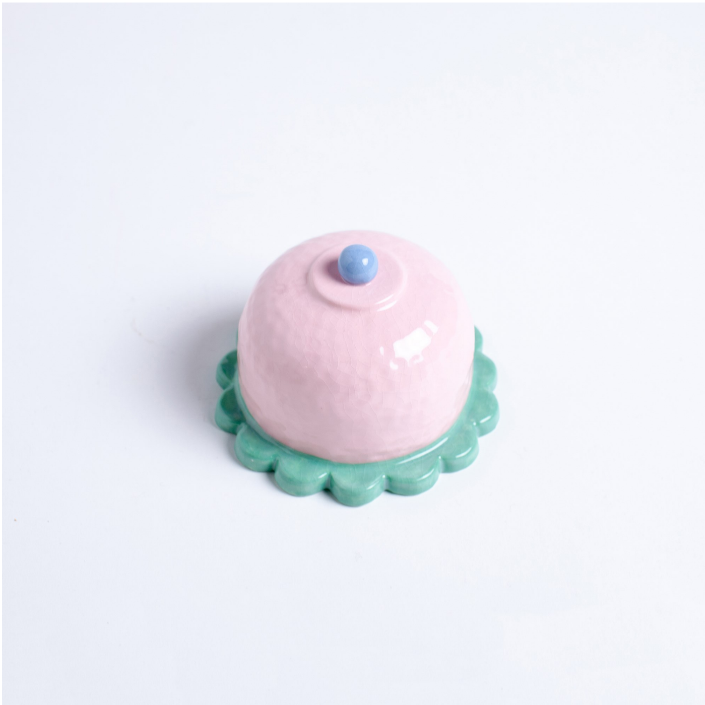
Count to Three #3, 2023 Glazed earthenware 10.5cm H x 7cm W x 10.5cm D $450