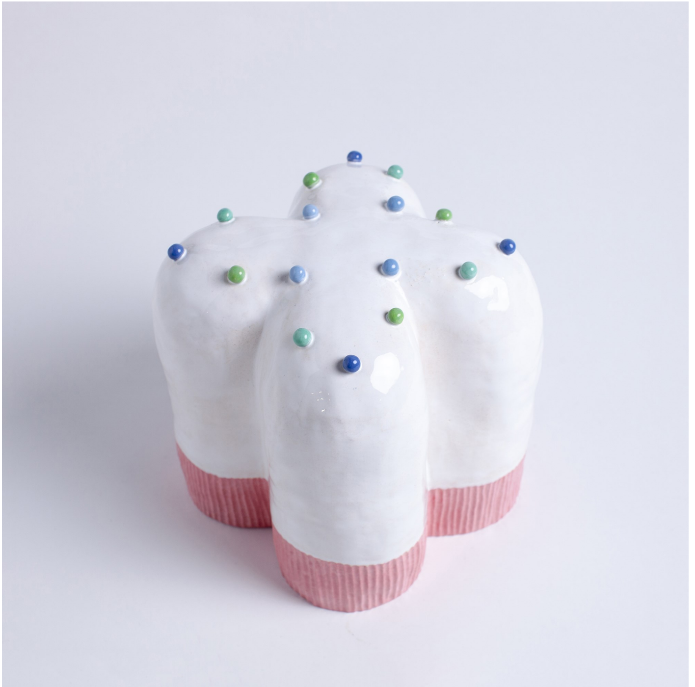
The Cross You Bear , 2023 Glazed earthenware 19cm H x 20.5cm W x 19cm D $1200