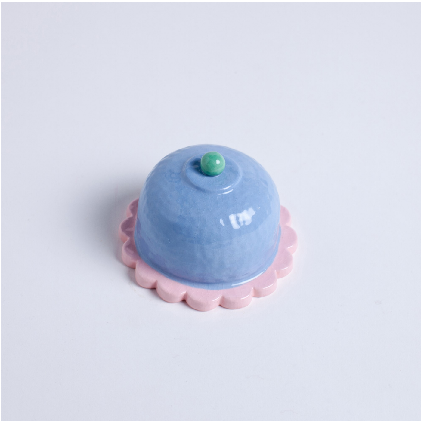
Count to Three #1, 2023 Glazed earthenware 10.5cm H x 7cm W x 10.5cm D $450