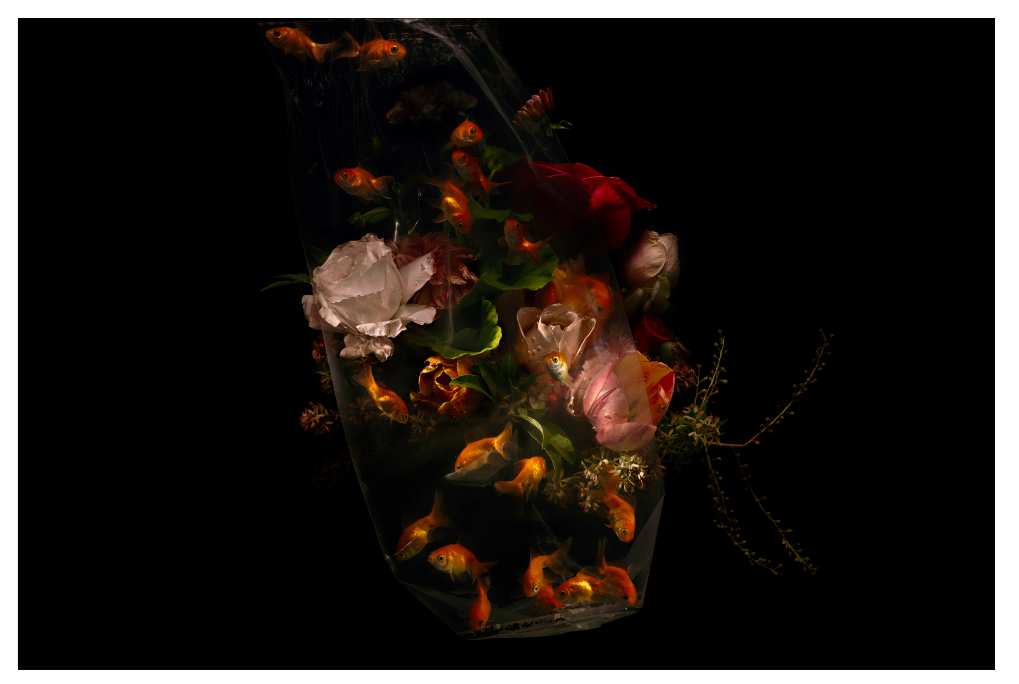
THE NEXT WORLD, 2021 Archival pigment print on fibre rag Edition of 8 + 2AP