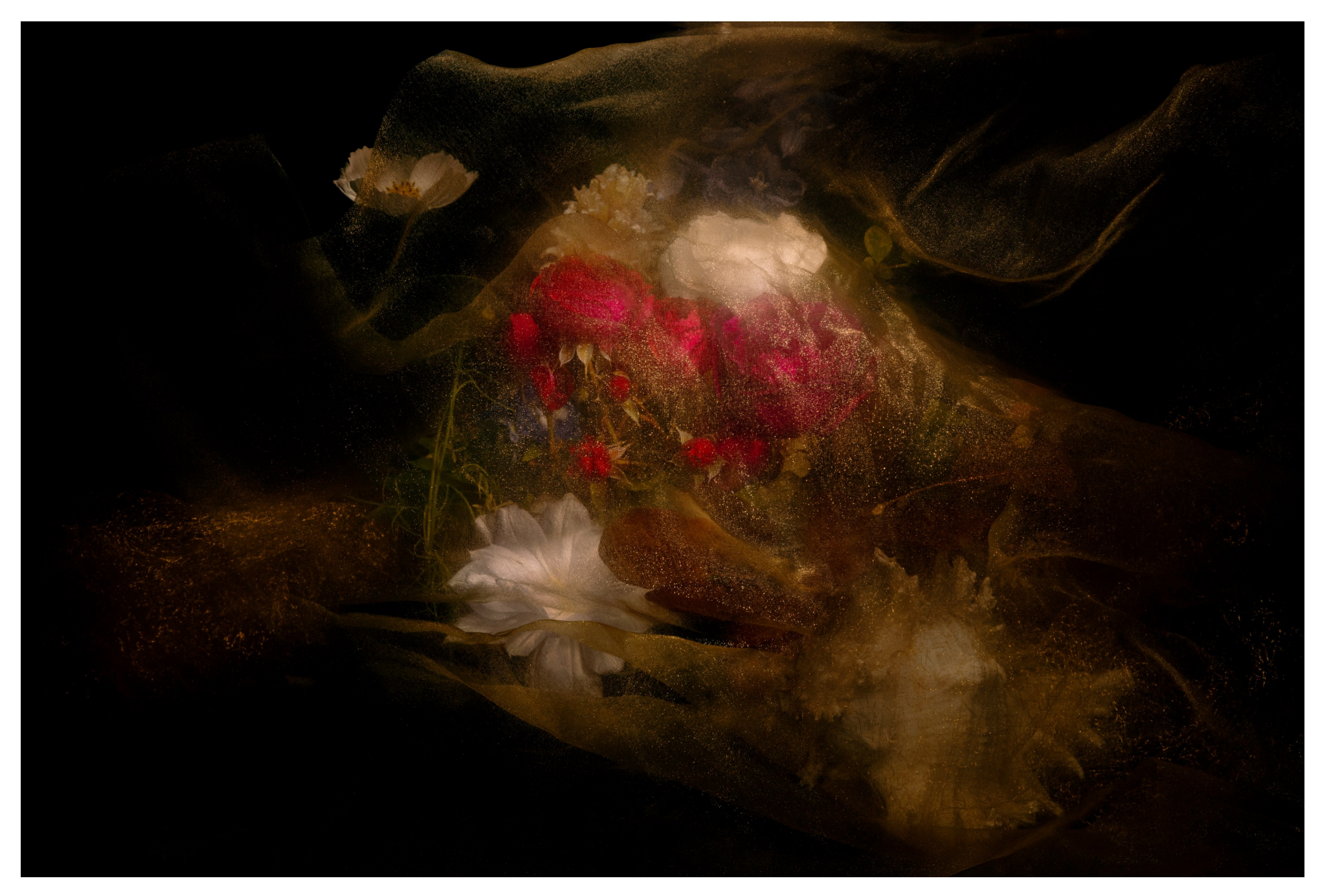
BEFORE THE FALL, 2021 Archival pigment print on fibre rag Edition of 8 + 2AP