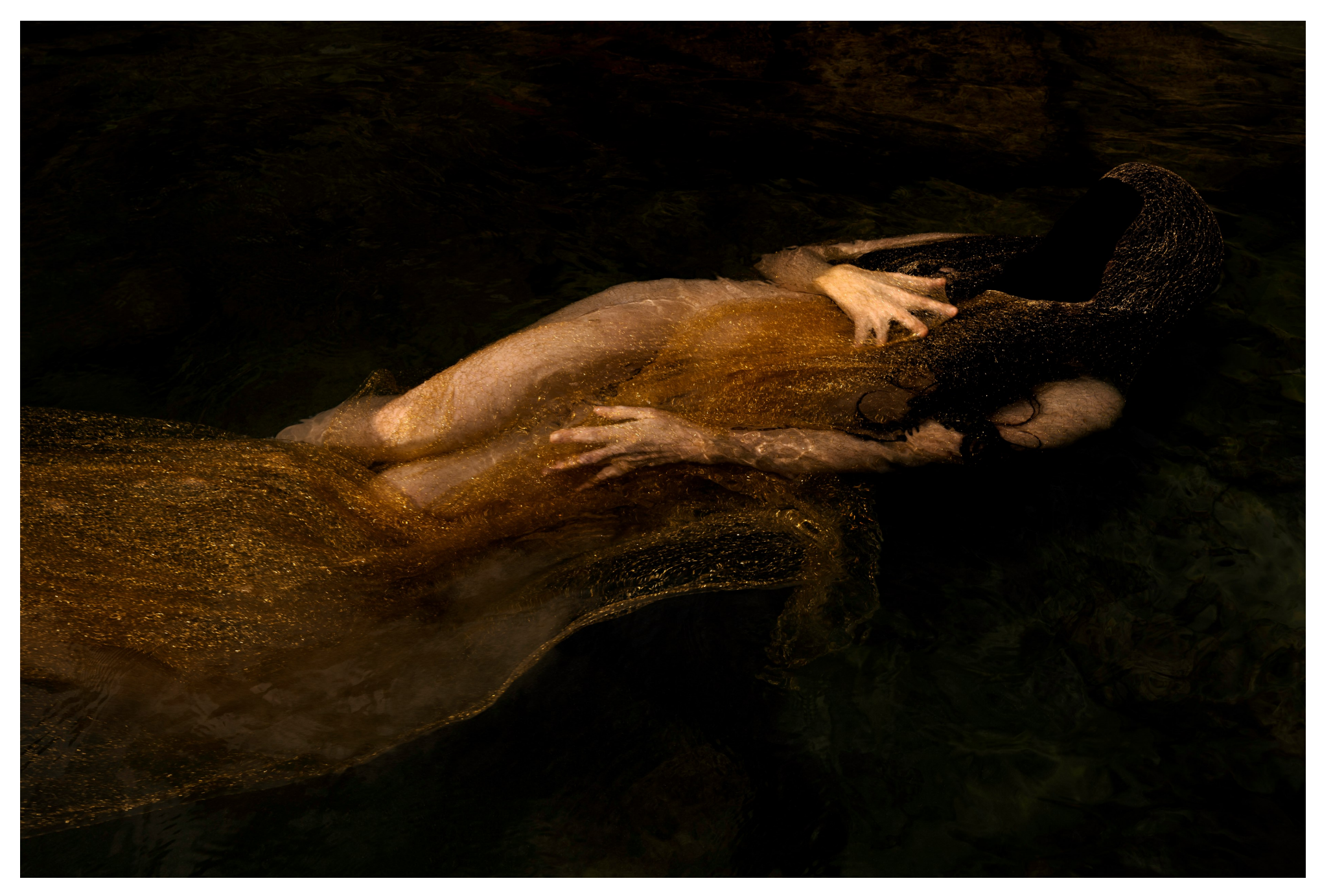
WHERE DREAMS INHABIT, 2021 Archival pigment print on fibre rag Edition of 8 + 2AP