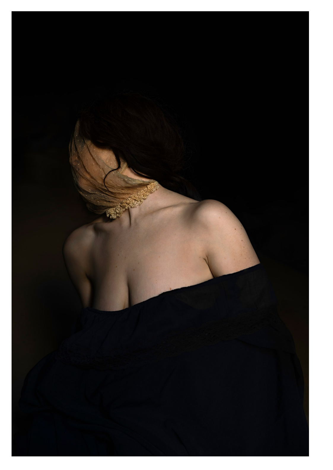
DEEP HOURS, 2021 Archival pigment print on fibre rag Edition of 8 + 2AP