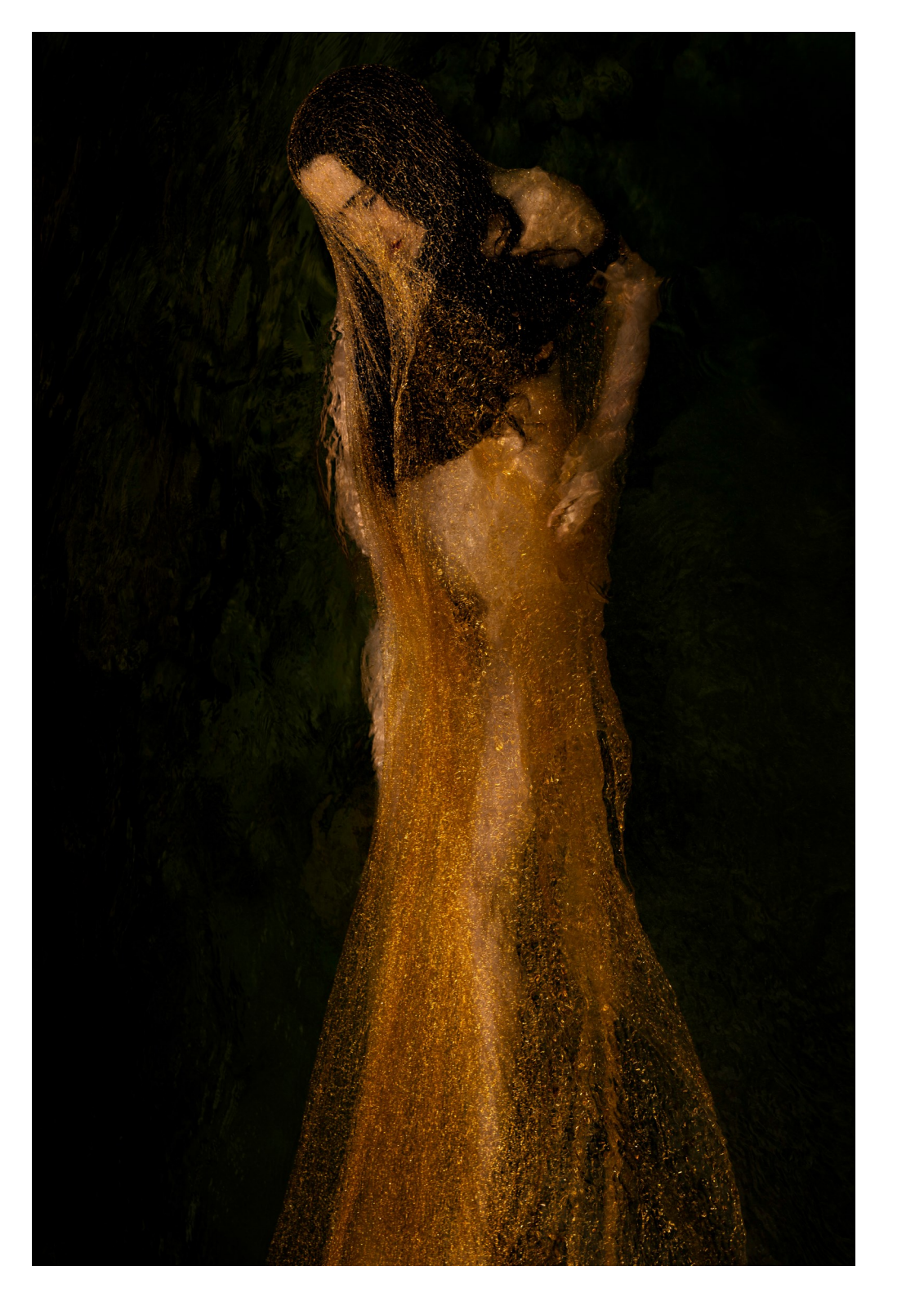
ASTRA, 2021 Archival pigment print on fibre rag Edition of 8 + 2AP