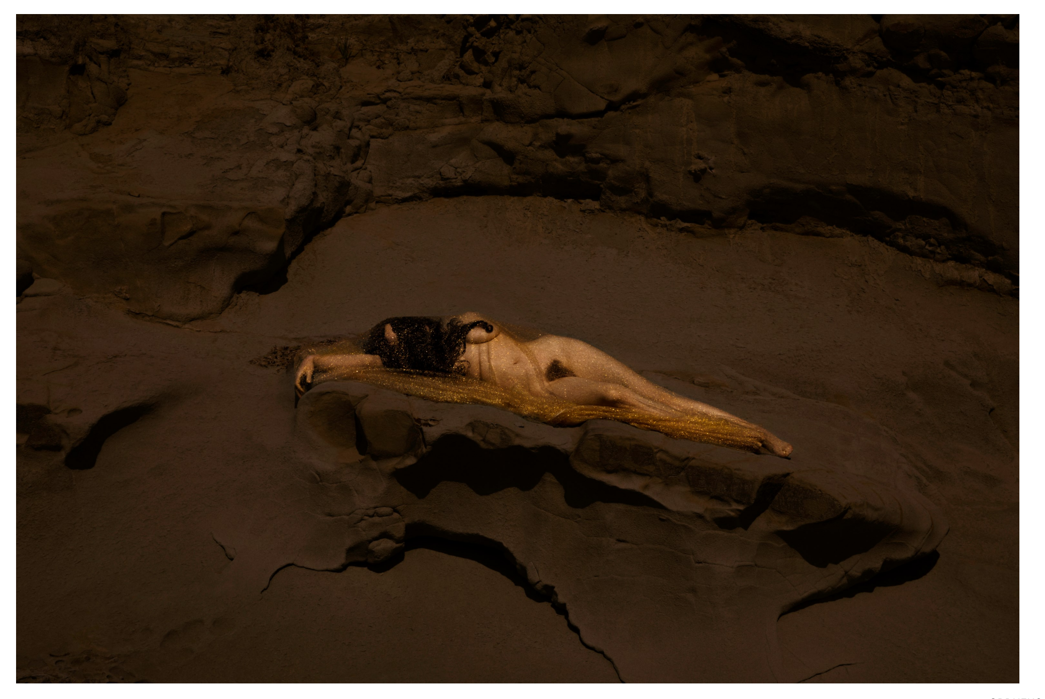
ORPHEUS, 2021 Archival pigment print on fibre rag Edition of 8 + 2AP