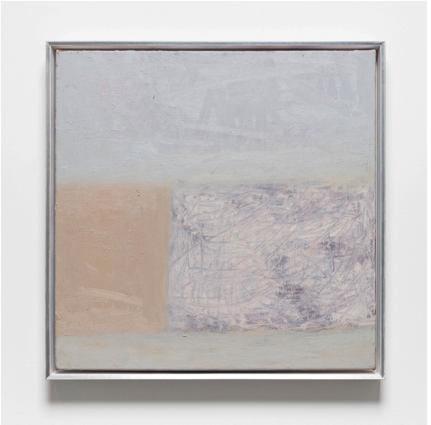
Still Life, 2025 oil on canvas 53 x 53 cm framed in white with silver profile AUD 2,600