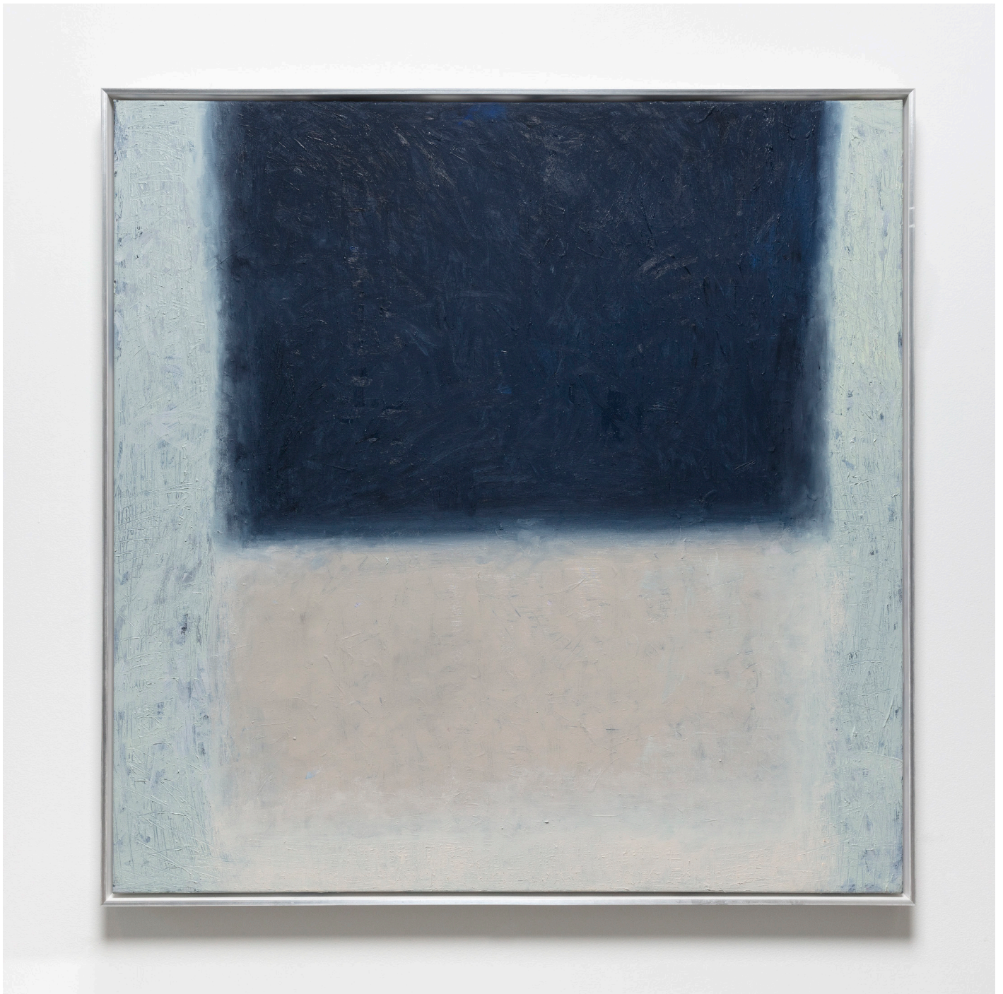
Private Song, 2025 oil on canvas 103 x 103 cm framed in white with silver profile AUD 6,000