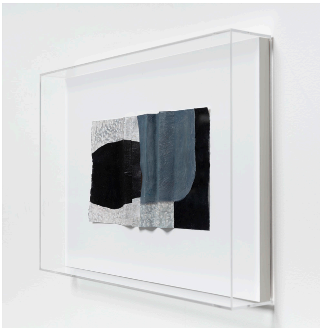
Shapeshifter II , 2025 gouache, acrylic, silverpoint on handmade paper 31 x 44 cm framed in acrylic box AUD 1,950