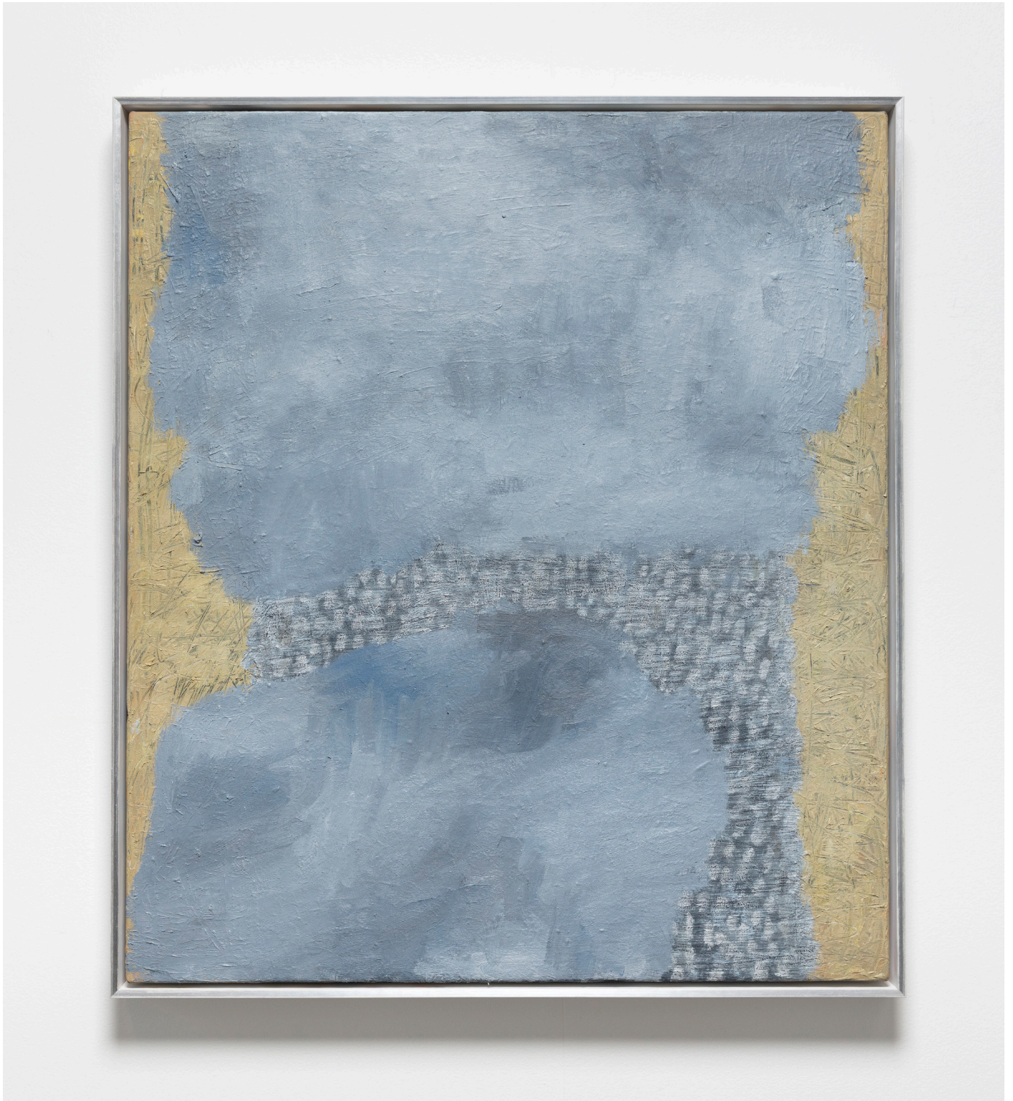
Silent Lake, Falling Sky , 2025 oil, graphite on canvas 88 x 78 cm framed in white with silver profile AUD 4,500