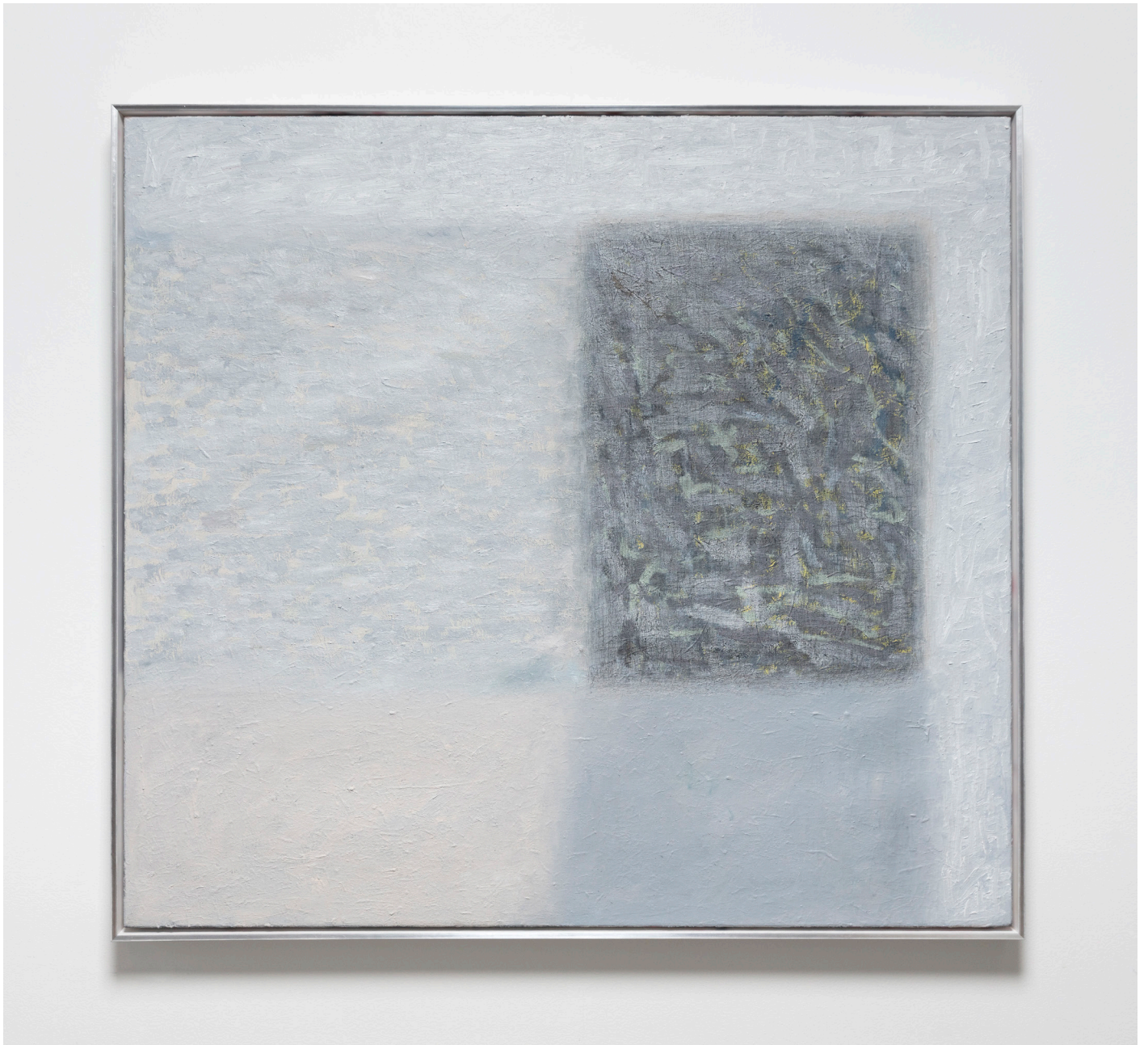
Writing to the Moon, 2025 oil on canvas 103 x 113 cm framed in white with silver profile AUD 6,300