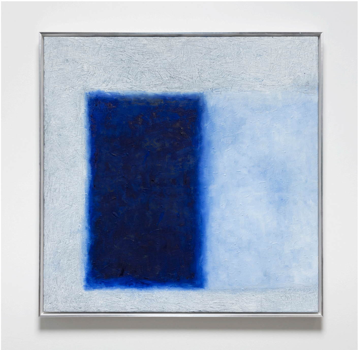
Firmament, 2025 oil, graphite on canvas 98 x 98 cm framed in white with silver profile AUD 5,700