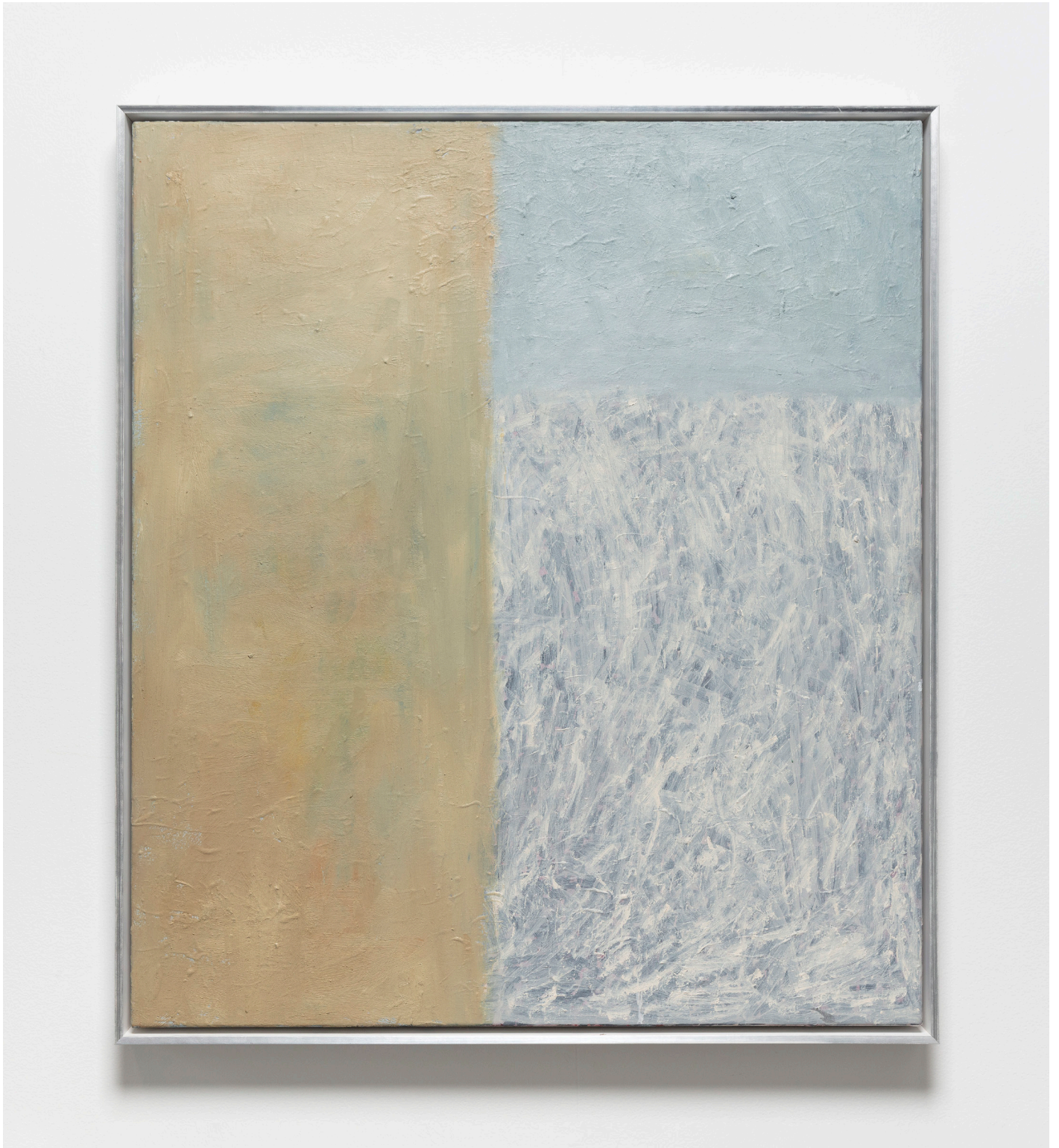
The Perfumed Room, 2025 oil on canvas 84 x 74 cm framed in white with silver profile AUD 4,300