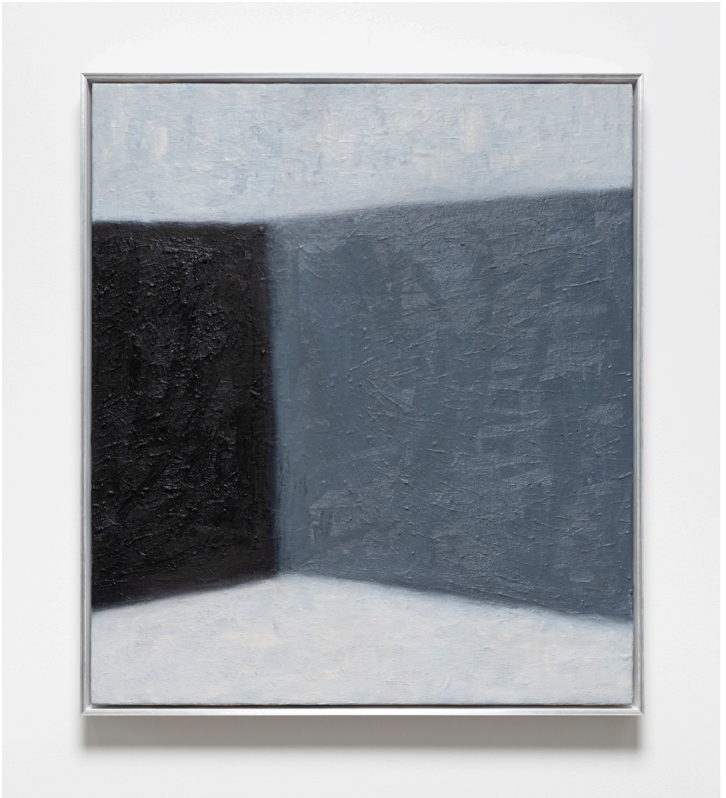
Resting Place, 2025 oil on canvas 84 x 74 cm framed in white with silver profile AUD 4,300