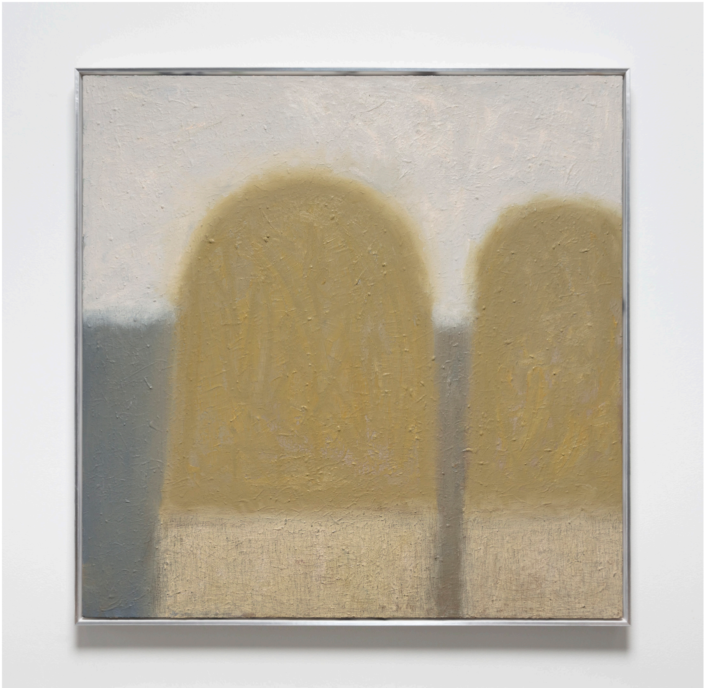
Slow Walk, 2025 oil, graphite on canvas 103 x 103 cm framed in white with silver profile AUD 6,000