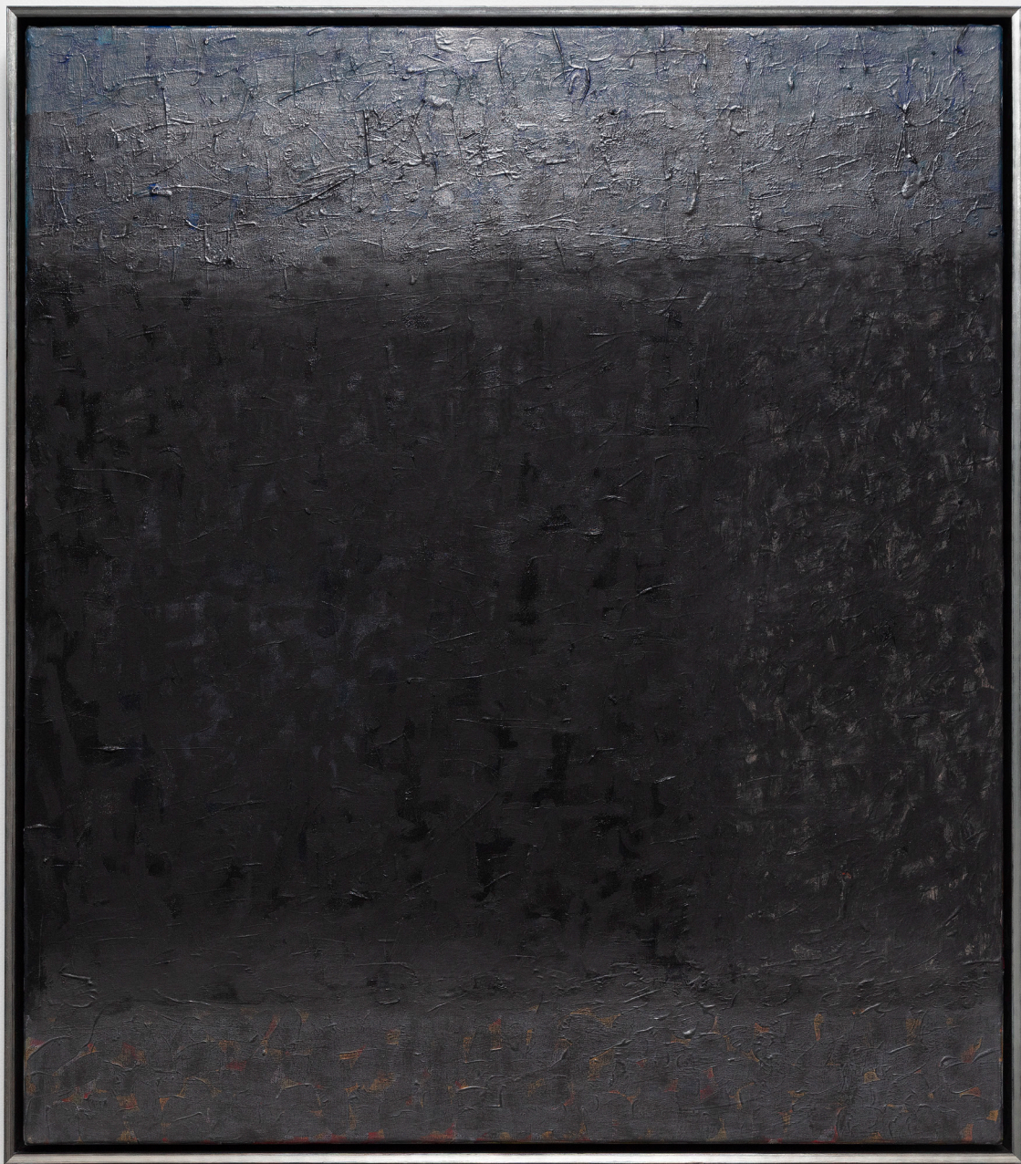
Tenebrae , 2025 oil, graphite on canvas 84 x 74 cm framed in white with silver profile AUD 4,300