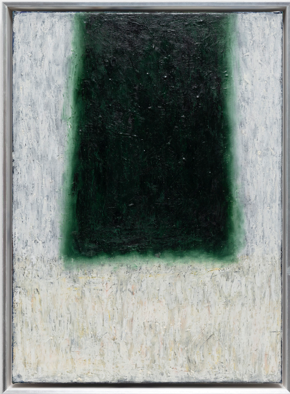
Green White Sea, 2025 oil, oil pastel on canvas 58 x 43 cm framed in white with silver profile AUD 2,500