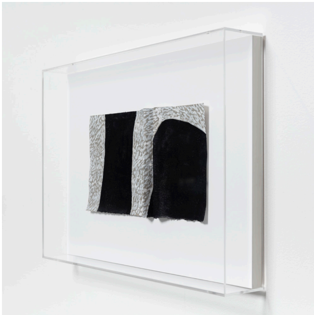
Shapeshifter IV, 2025 gouache, acrylic, silverpoint on handmade paper 31 x 44 cm framed in acrylic box AUD 1,950