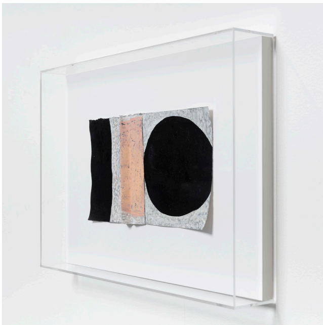
Shapeshifter V , 2025 gouache, acrylic, silverpoint on handmade paper 31 x 44 cm framed in acrylic box AUD 1,950