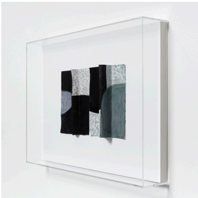
Shapeshifter III , 2025 gouache, acrylic, silverpoint on handmade paper 31 x 44 cm framed in acrylic box AUD 1,950