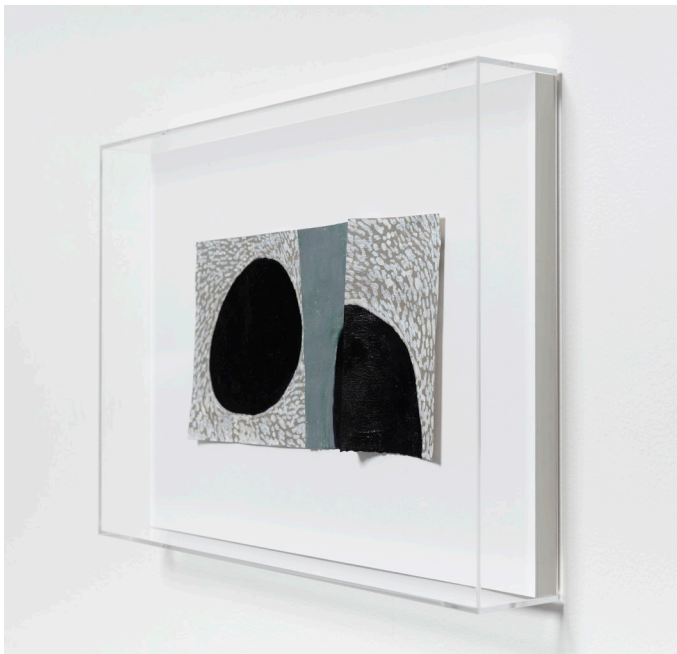
Shapeshifter I , 2025 gouache, acrylic, silverpoint on handmade paper 31 x 44 cm framed in acrylic box AUD 1,950