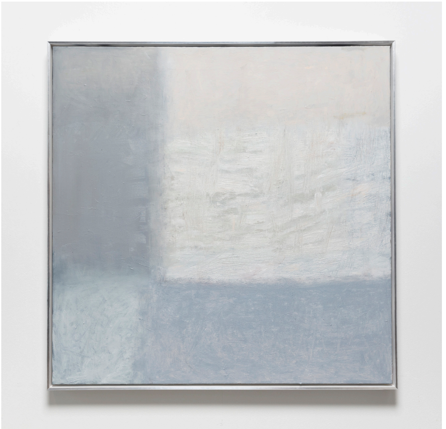
Mirage , 2025 oil, graphite on canvas 99 x 99 cm framed in white with silver profile AUD 5,700