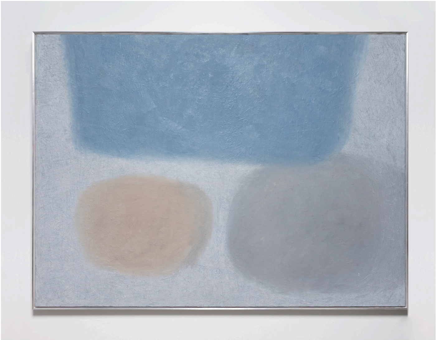
Pause, 2025 oil, graphite on canvas 157 x 227 cm framed in white with silver profile AUD 9,900