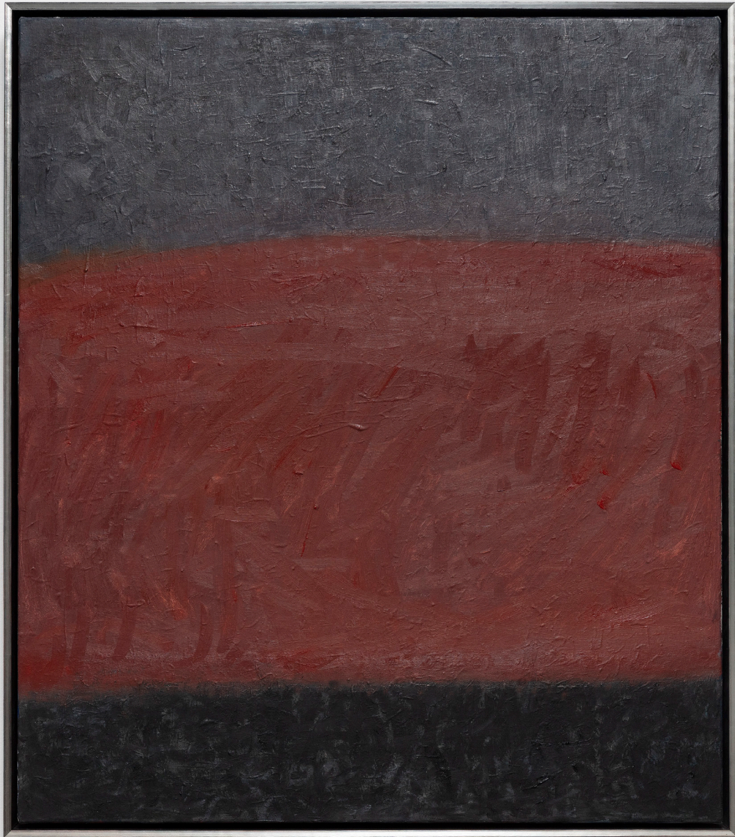
Without Walls, 2025 oil, graphite on canvas 84 x 74 cm framed in white with silver profile AUD 4,300