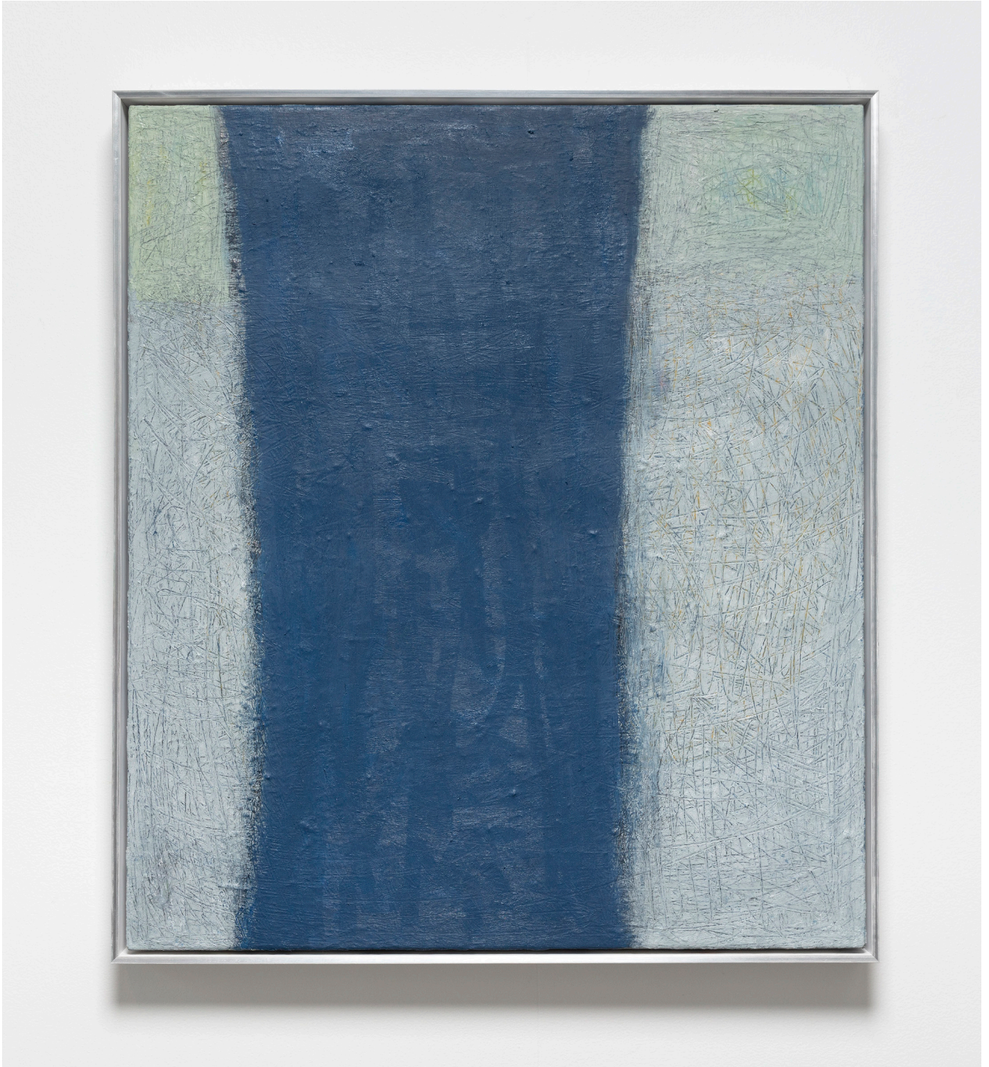
Azure , 2025 oil, graphite on canvas 84 x 74 cm framed in white with silver profile AUD 4,300