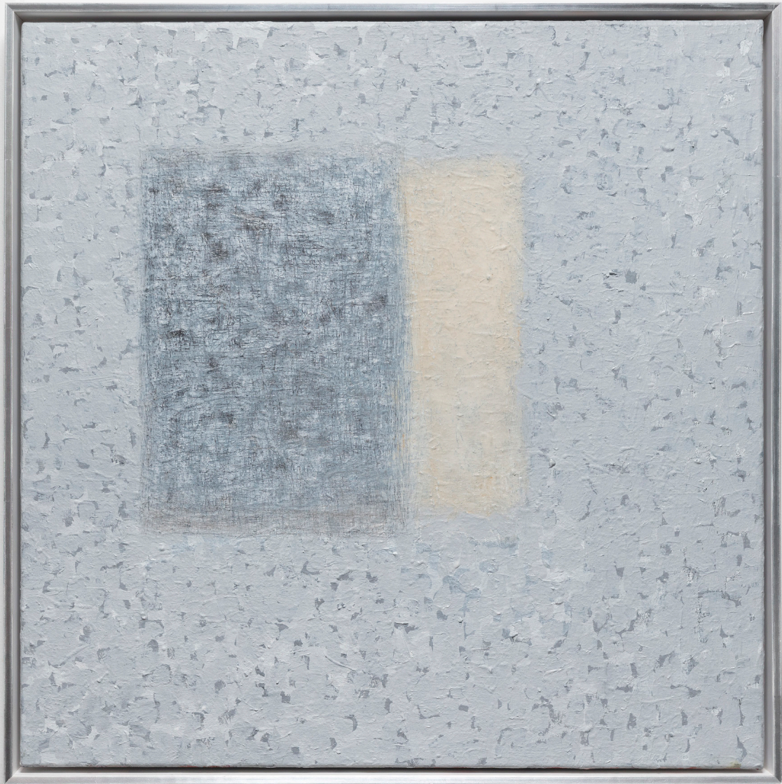
Rainmaker , 2025 oil, acrylic, graphite on canvas 69 x 69 cm framed in white with silver profile AUD 4,300