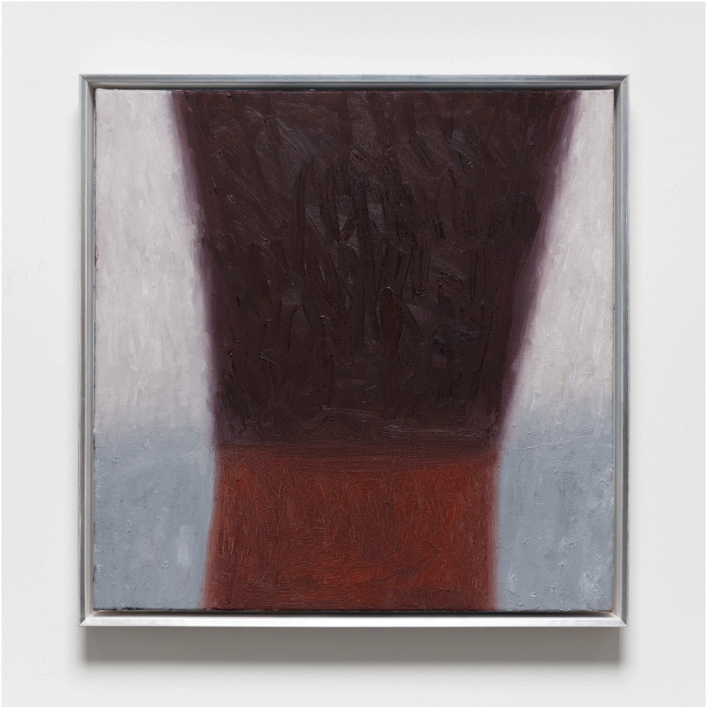
Luminary, 2025 oil on canvas 53 x 53 cm framed in white with silver profile AUD 2,600